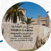
BORJ DAR BARROUD